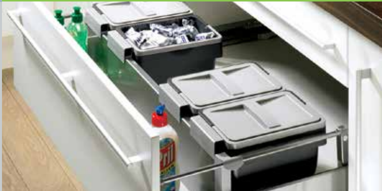
InnoTech OrgaFlex under sink drawer