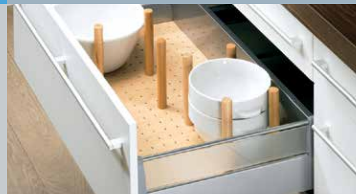
InnoTech drawer with timber universal organiser