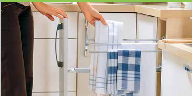
Pull out towel rail