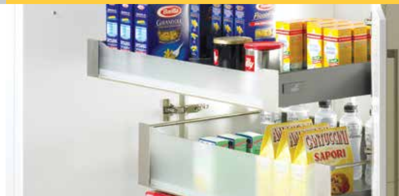
InnoTech internal drawers with glass fronts as pantry