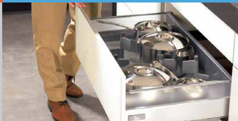
InnoTech pot & pan drawer with OrgaFlag