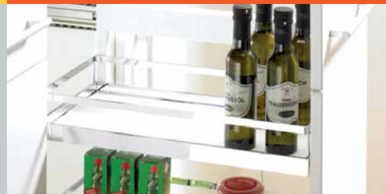
Base unit pull out