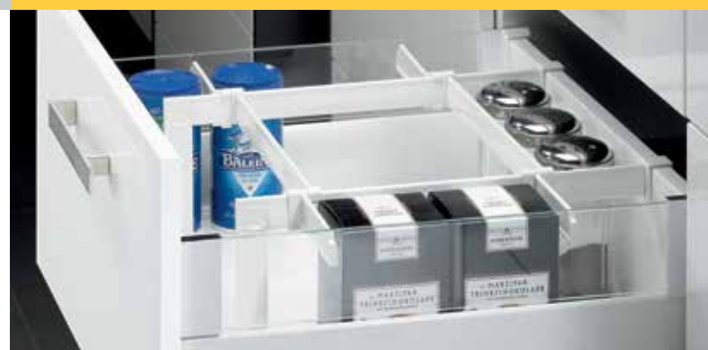
InnoTech pot & pan drawer with OrgaStore 300 organiser

Take advantage of today's wide range of innovative fittings