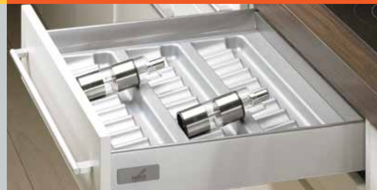
InnoTech drawer with OrgaTray 800