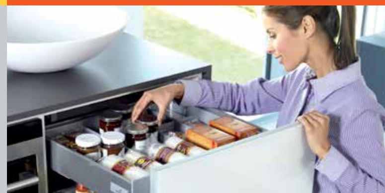
InnoTech internal drawers as pantry