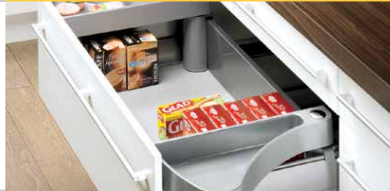
InnoTech pot & pan drawer with OrgaWing