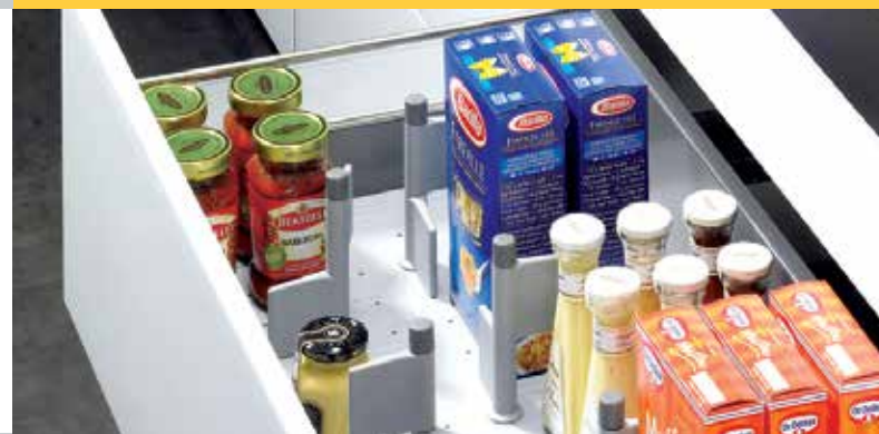
InnoTech pot & pan drawer with OrgaFlag