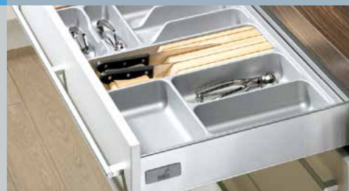
InnoTech drawer with OrgaTray 410