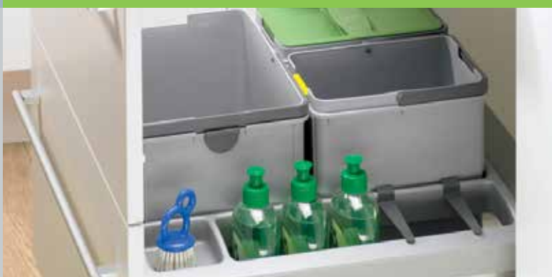
InnoTech InnoFlex recycling & storage system