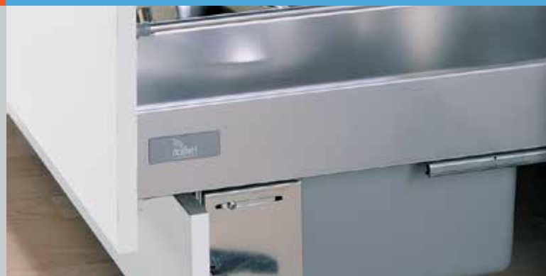
InnoTech XXL drawer for pot & pan storage