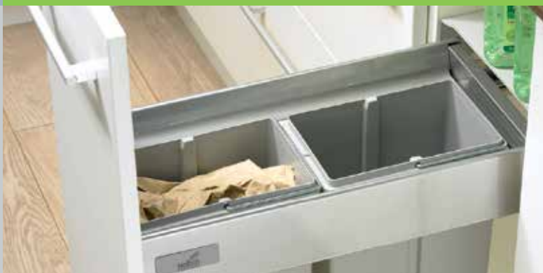
InnoTech Pull waste & recycling system

Take advantage of today's wide range of innovative fittings