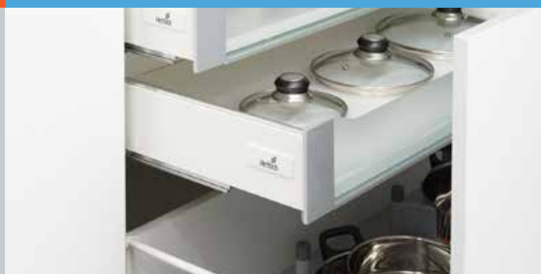
InnoTech Exclusiv internal drawers