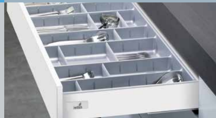
InnoTech drawer with OrgaTray 560