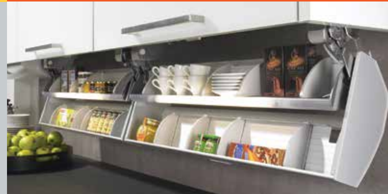
Cosario organisation system