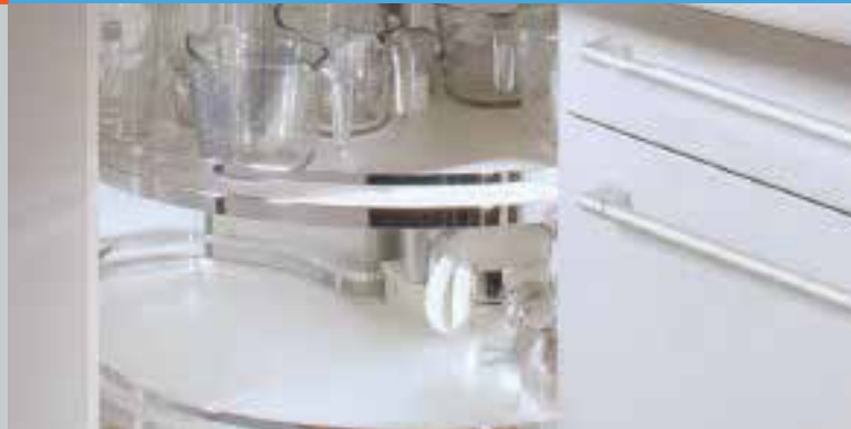
Folding door corner unit revolving fitting Revo 90