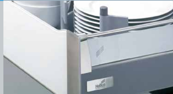
InnoTech internal drawer with glass front & OrgaFlag